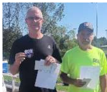
10-11-25 CLK 1 st Pepper CL A