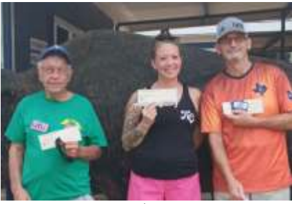
Buffalo HT CL I 3 rd R. Allen