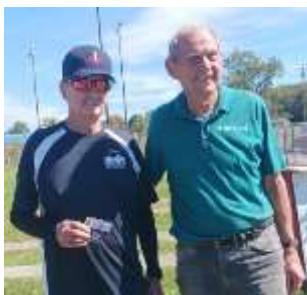
10-04-25 WP CLA 1 st