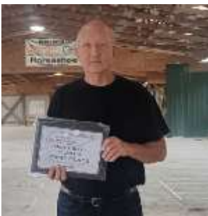
Men 30 Ft CLA 1 st Pinkston