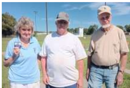
10-04-25 WP CLB 1 st Manis 2 nd Nease